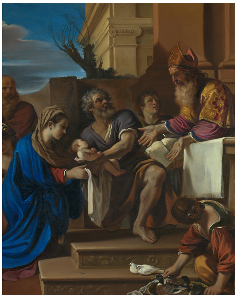
Guercino - The Presentation of Jesus in the Temple NG6646 National Gallery, London.